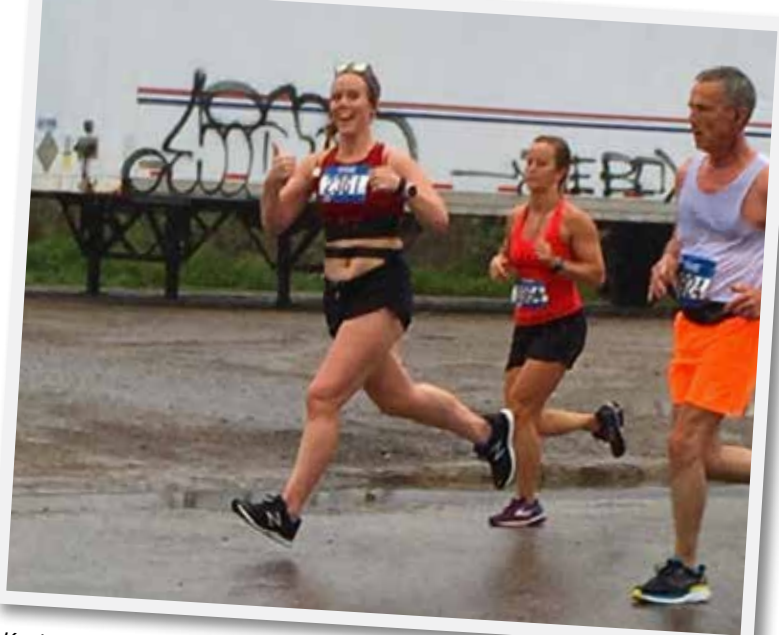
Kuch, early in the race.

Miles 7-9 – 7:59, 8:06, 8:07 – Still had heavy-feeling legs from the hill and tried to shake it off. I was still on pace but it was feeling more difficult. Overall, I just felt kind of odd. Once I hit 9.5 I was at about an 8:25 and it felt way too hard. That's my go-forever pace, and I knew something was wrong.